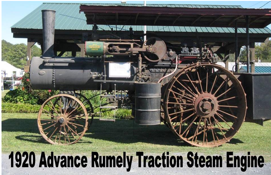
1920 Advance Rumely Traction Steam Engine